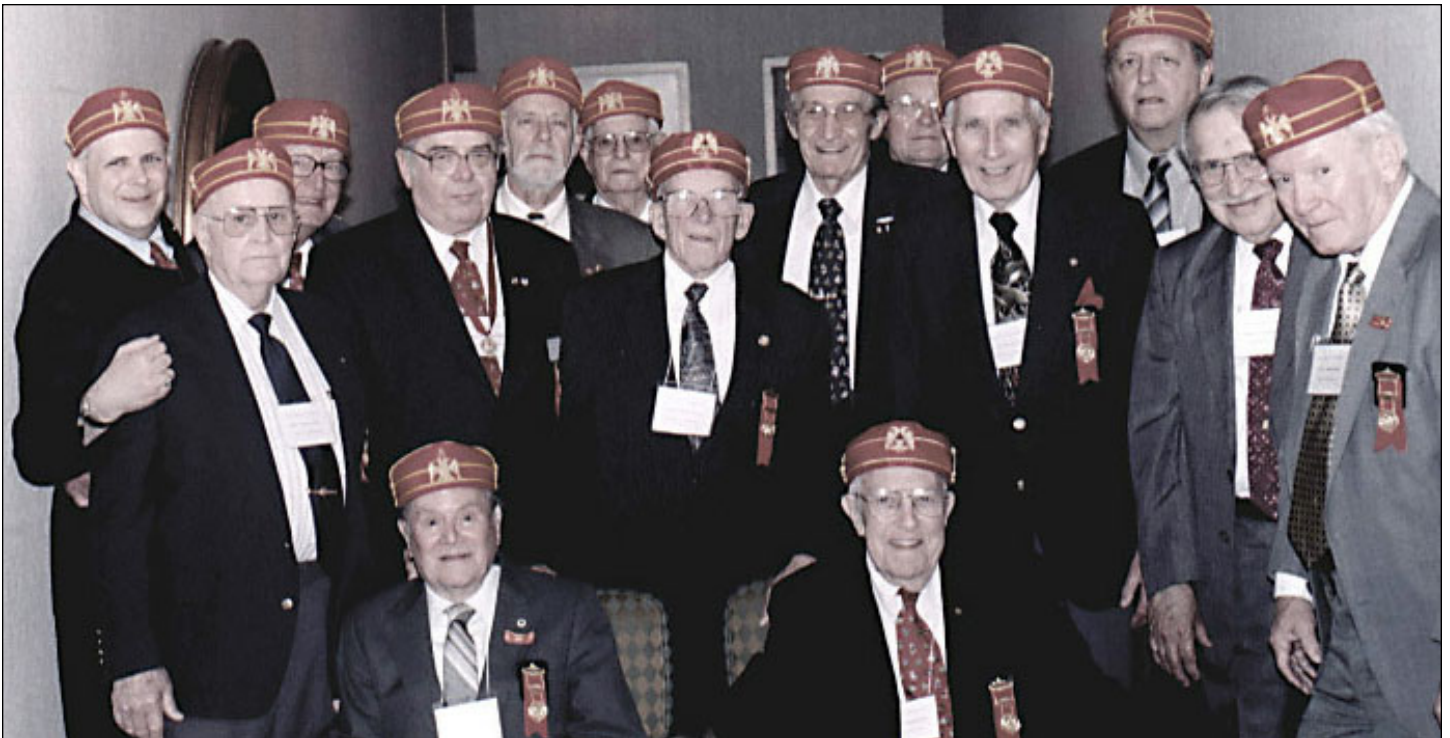
The Valley of Cleveland Meritorious Service Award brethren pictured at the Ohio Council of Deliberation meeting June 4, 2004