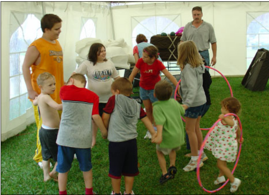
Several of the children are gathered to play one of the most popular games of the picnic. It was great fun and the children enjoyed their afternoon ...even though it was raining. The picnic was held at the Al Koran Shrine Pavilion August 29th.