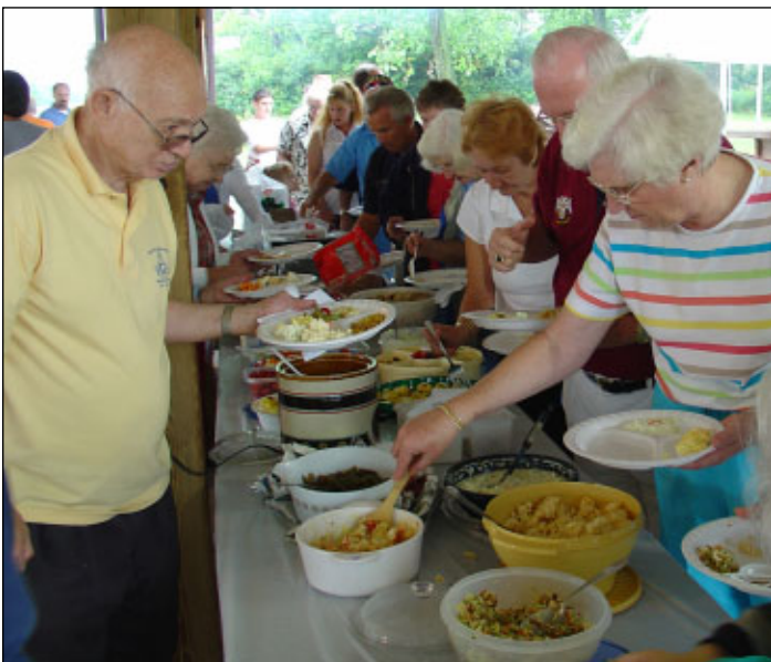
There was plenty of food to go around as the picnickers found at the Valley of Cleveland Summer Picnic. Over 250 brethren and their families attended the annual event. Watch for next year's summer picnic announcement date in the Scottish Rite News in May, 2005.