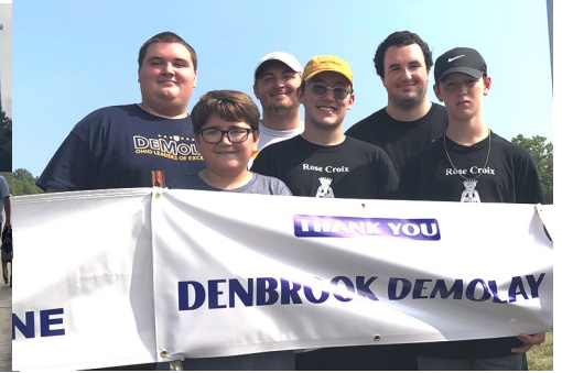
Members of the Second District were on hand again passing out water during the walk. Pictured above are members of Denbrook DeMolay and a prospective member showing off the newest banner for their donation of over $500!!!! Consider donating $500 or more from your family, work, or your lodge to follow their lead!