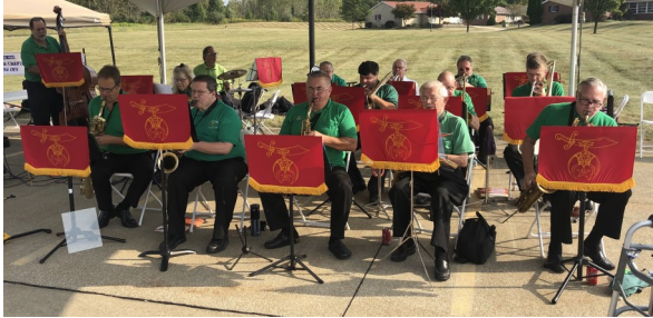
The Al Koran Shrine Band once again entertained the walkers with their beautiful music. Thank you so much for their continued support of the Learning Center Walk.