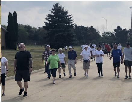
The first wave of walkers and supporters start the course at the WRMC!