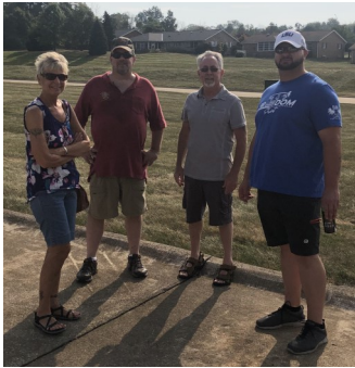
The Commander-in-Chief and part of his crew of chefs.