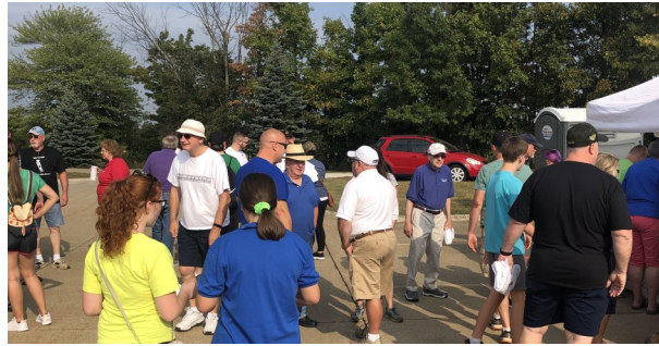
The Commander-in-Chief and part of his crew of chefs.